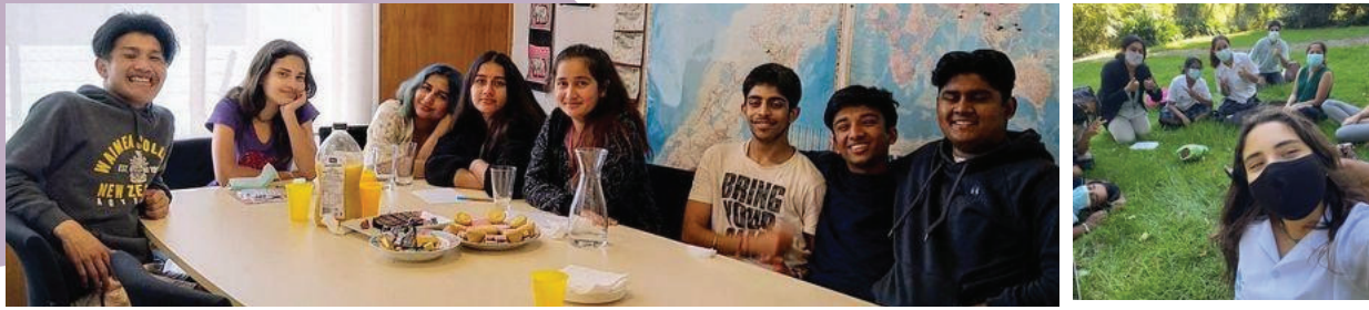
MYNTies meet fortnightly at the Multicultural Nelson Tasman office to talk about plans for projects and events.